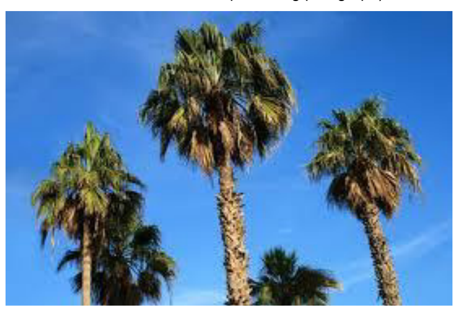
Photograph of Washingtonian Palms with lower rings of fronds browning out and drooping creating the "Hula Skirt" appearance.

Rules will advise homeowners of Washingtonian Palm trees requiring trimming when the lower ring of fronds brown out and droop, creating a hula skirt appearance. The ACC recommends trimming Washingtonian Palms to the 9:00-3:00 o'clock position. (The Photograph below illustrates when Washingtonian Palms are beyond the point where trimming is required. A properly 9:00-3:00 o'clock position Washingtonian trim should be similar to the illustration in the preceding paragraph).